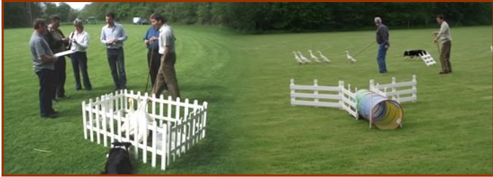
DUCK HERDING—listening skills, teamwork, time management Using our well behaved dog, control him to guide the ducks though gates, over bridges, across cross roads, before heading back to base.