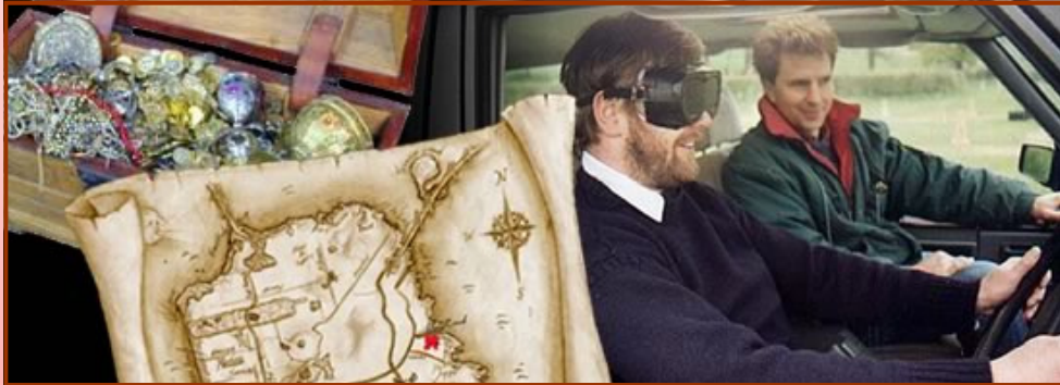
4X4 TREASURE HUNT—communication, leadership The aim is to find as many clues & treasures whilst driving a 4x4. Sounds easy? Guess Again! You will be blindfolded! The only help you'll receive will be from base group command! So effective communication skills are paramount! Can you solve the clues and reach the end of the course successfully? Your fate is in the hands of your team?!