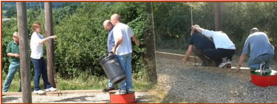
GULLY ISLAND SWING - planning, problem solving, teamwork The team with their fragile burden must travel across a “300ft ravine” by way of the hanging rope. Many areas are out of bounds so be careful not to “fall in”.