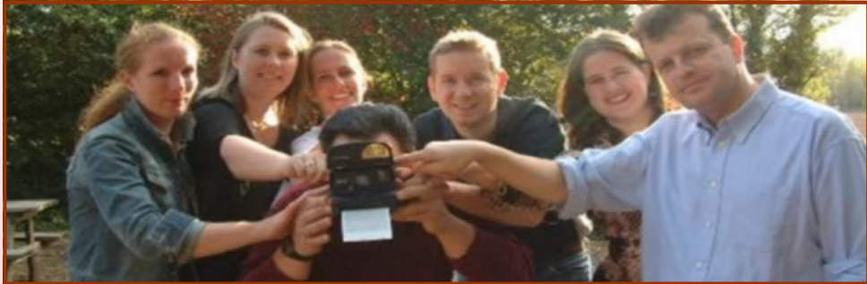
CRYPTIC CHALLENGE—communication, creativity, logic, teamwork A fun event solving cryptic clues—but beware the camera provided only takes 10 photos and there are 10 clues to solve.