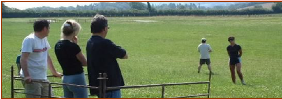
SHEEP & SHEPHERD—communication, leadership, team building, trust The shepherd must secure all your sheep (blind-folded members of your team!!) in a pen with the use of a whistle only - no other means of communication allowed, You only have minutes to decide how!